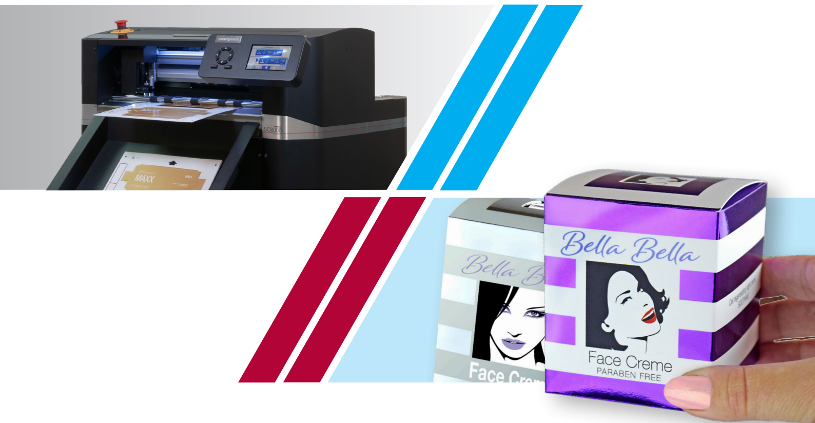
Morgana SC6000 Automatic Die-Cutter